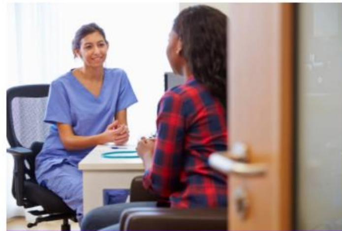
For health professionals