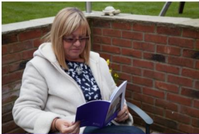
For people affected

Our information covers everything about pancreatic cancer to help you understand your diagnosis, ask questions, make decisions and live as well as you can. It is easy to understand and reviewed by experts. All our information is free.